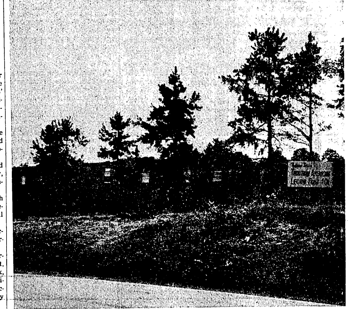
TROUTMAN LEGION POST WILL BE ON A SPACIOUS, WOODED LOT Determined Members Hope To Have The Roof On Before The Week Is Out