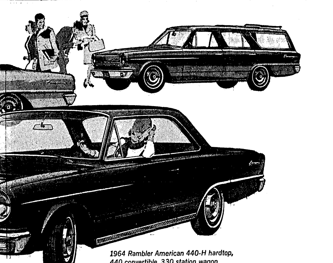
1964 Rambler American 440-H hardtop, 440 convertible, 330 station wagon