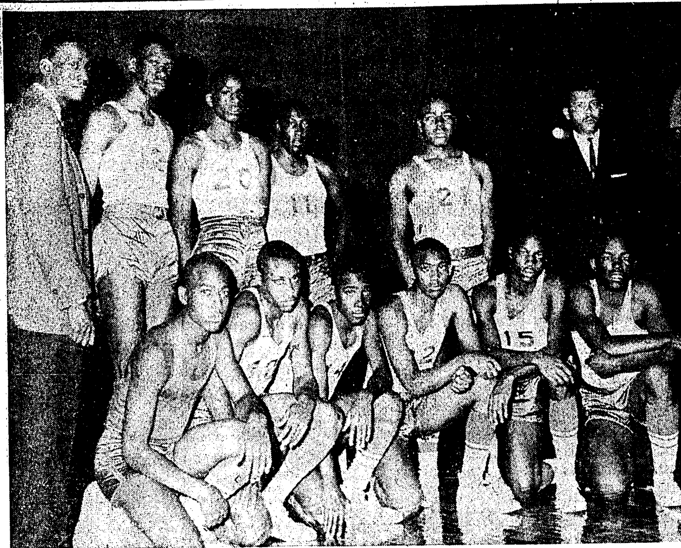
VARSITY TROJANS — This is the current edition of the Dunbar Trojans. The team is the defending conference champion, and it has advanced to the state tournament the past two years. Through games of December 17, this varsity team had compiled a record of five wins and one loss. The Trojans were tripped up by Torrence Lytle High of