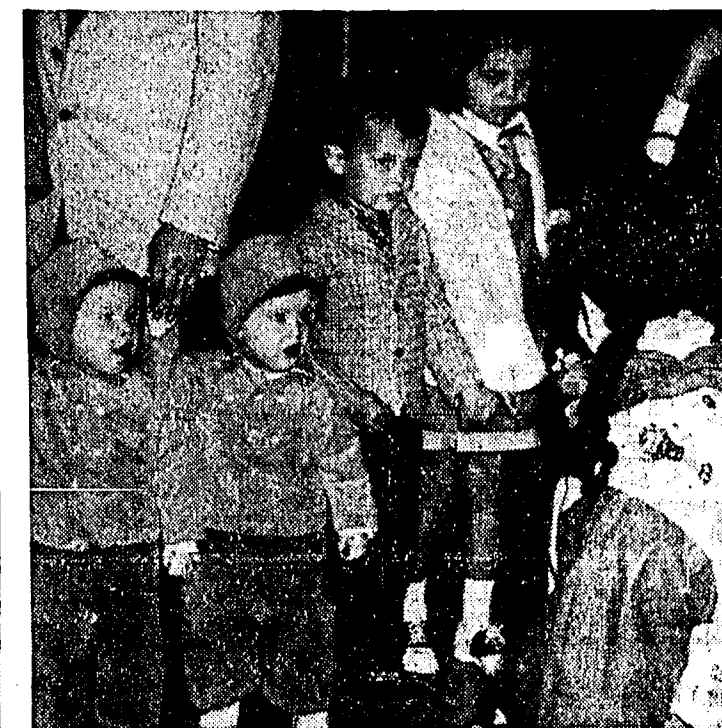
MOORESVILLE CLOWNS ENTERTAIN YOUNGSTERS But Not A Smile From These Four At Yule Party