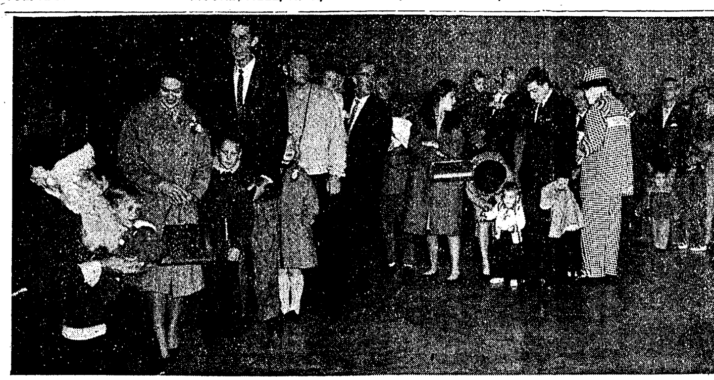
TO TALK WITH SANTA, THE LINE FORMS TO THE RIGHT Both Young And Old Enjoy Bending Santa's Ear