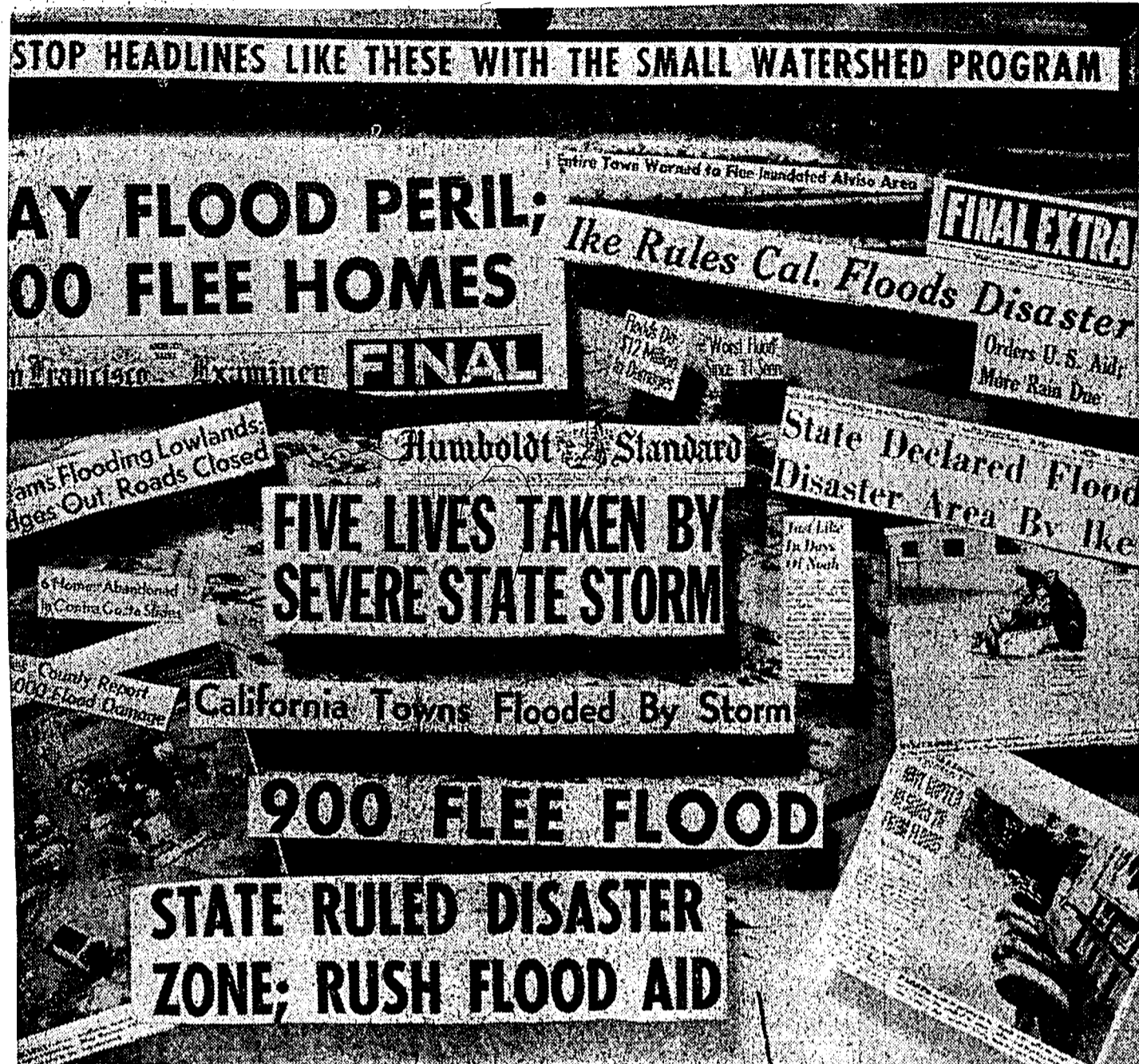
Second, Third, and Fourth Creeks are all in various stages of development under the Soil Conservation Service's Small Watershed Program. The Program is designed to stop headlines such as these.