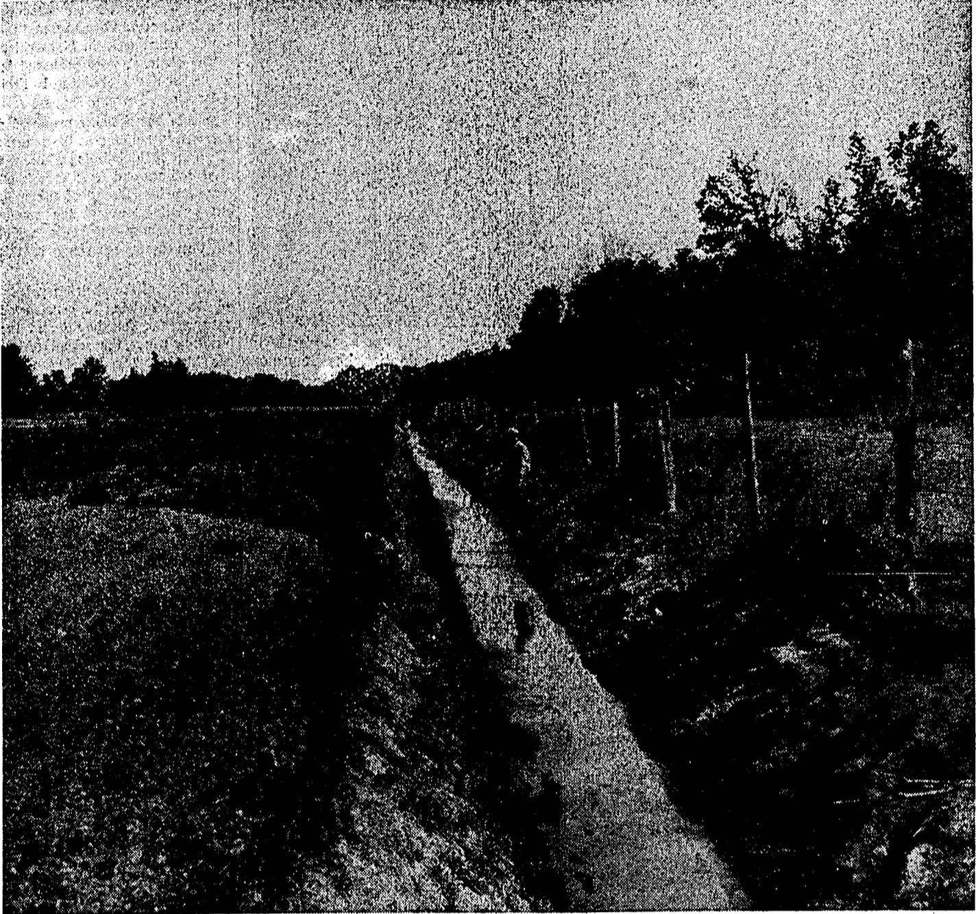
Drainage of wet land is part of the land treatment done by the landowners in the Small Watershed Program.