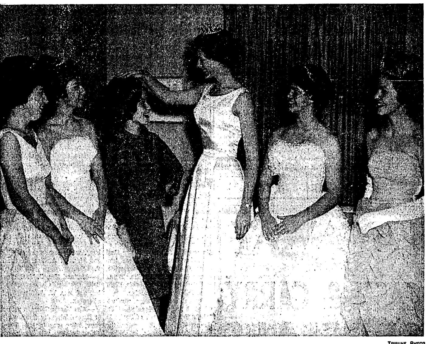
Our Special Guest With A Bivy Of Local Beauties