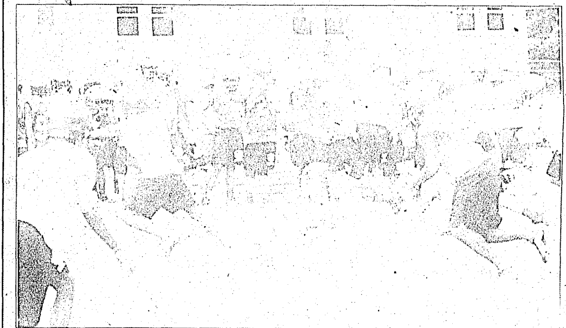
Hoping practice makes perfect, teams goes through preparations for final preseason scrimmage

Suddenly, the preseason scrimmage season has evolved into a battle of survival for Mooresville's football team.