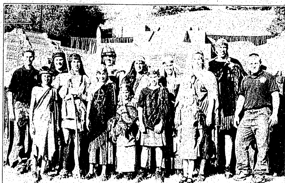
Mooresville families pose in full costumes ready to participate in America's Witness for Christ Pageant in New York.

Wednesday, August 15, 2001 - MOORESVILLE TRIBUNE - 7A