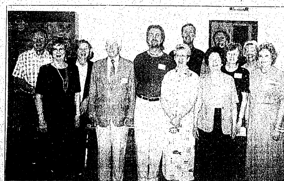
New Board of Directors for Iredell Concert Association complete plans for new year.