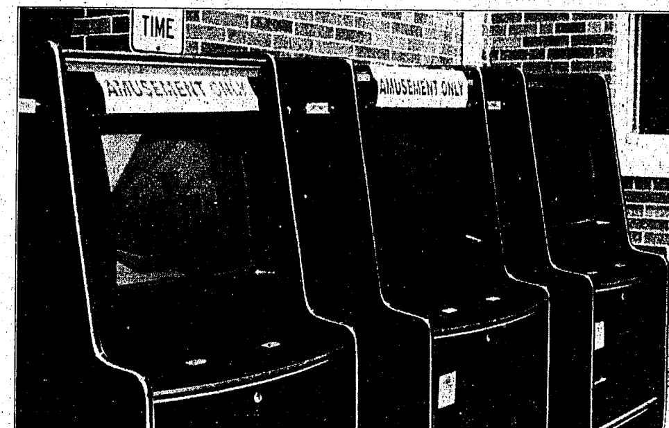
Mooresville Police detectives seized three poker machines (above) and more than $2,000 in cash (right) from the Lonesome Dove Inside Yard Sale.

work found at Lonesome Dove Inside Yard Sale, detectives estimated the poker machines were netting the operator a profit of about $1,200 a week. Since April, when the machines were placed in the store, police estimate that some $48,000 has been spent by patrons playing the machines, netting more than $16,000 for the operator since April.