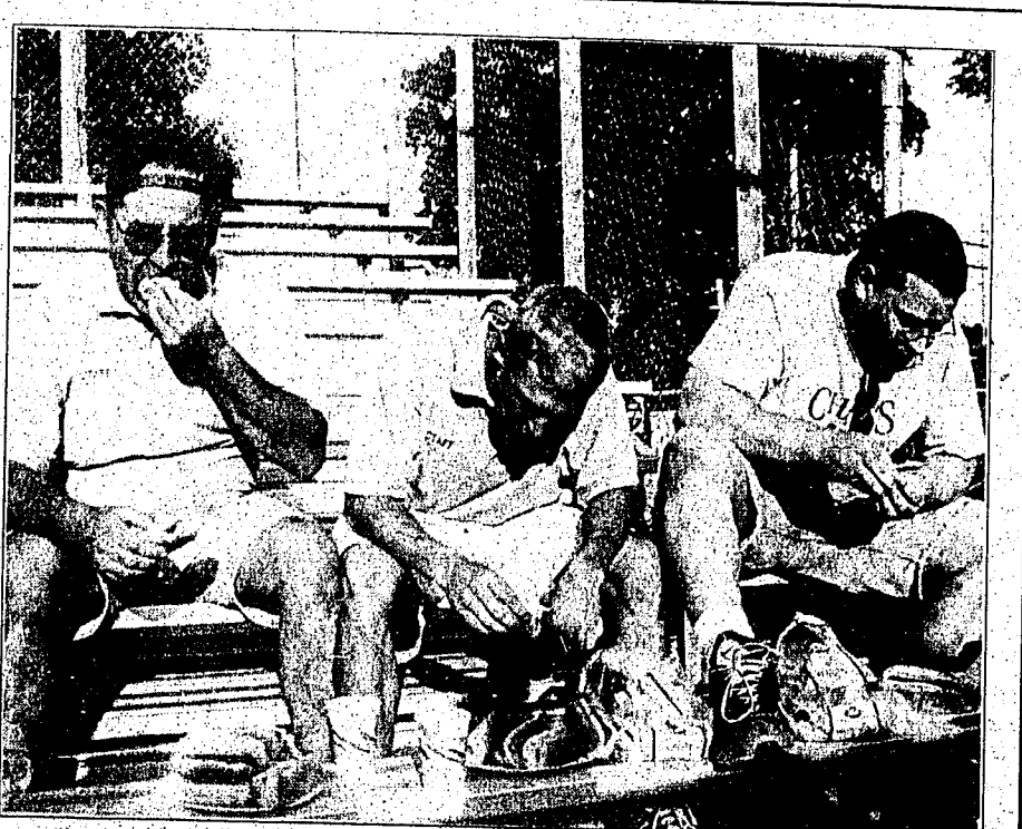
Contest's top dog tops all hot dog eaters

Official announcement of the all-Iredell softball team was made courtesy of the Statesville Record & Landmark.