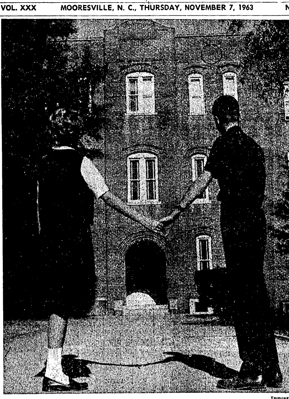
OUR YOUTH—THE RAW MATERIAL THAT WILL SHAPE THE FUTURE Only Through Education Can America Utilize This Priceless Resource

VOL. XXX MOORESVILLE, N. C., THURSDAY, NOVEMBER 7, 1963 No. 38