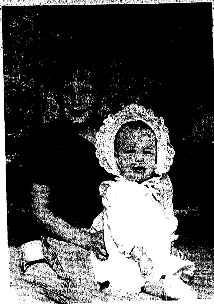
"TO MOM WITH LOVE"

Thyme Square, Hwy. 150, Mooresville, 663-0156