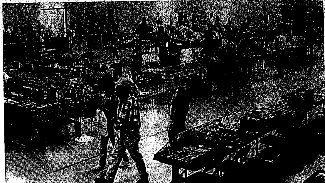
Vendors vending, collectors browsing at gym-floor full of displays