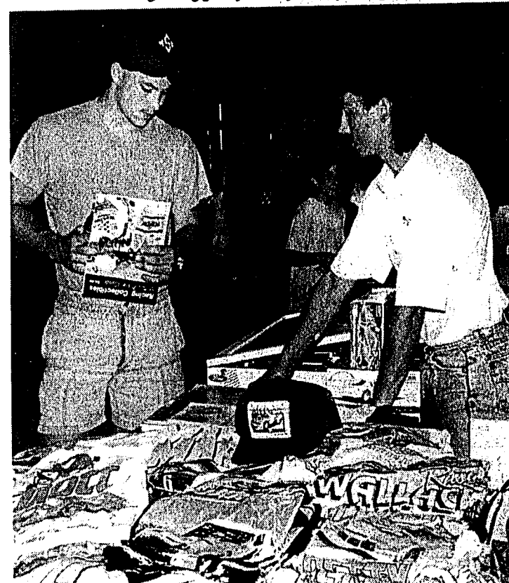
T-shirts, hats among favored items

They joined a wide array of vendors, and a wider group of buyers, at Mooresville's first Racing Collectibles Show.