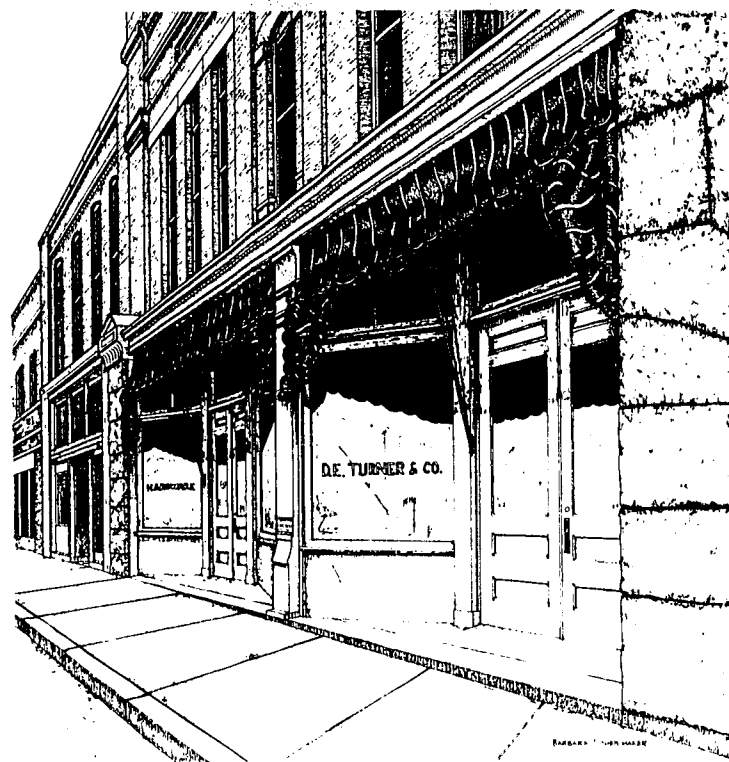
Shoemaker's example of Festival art selections