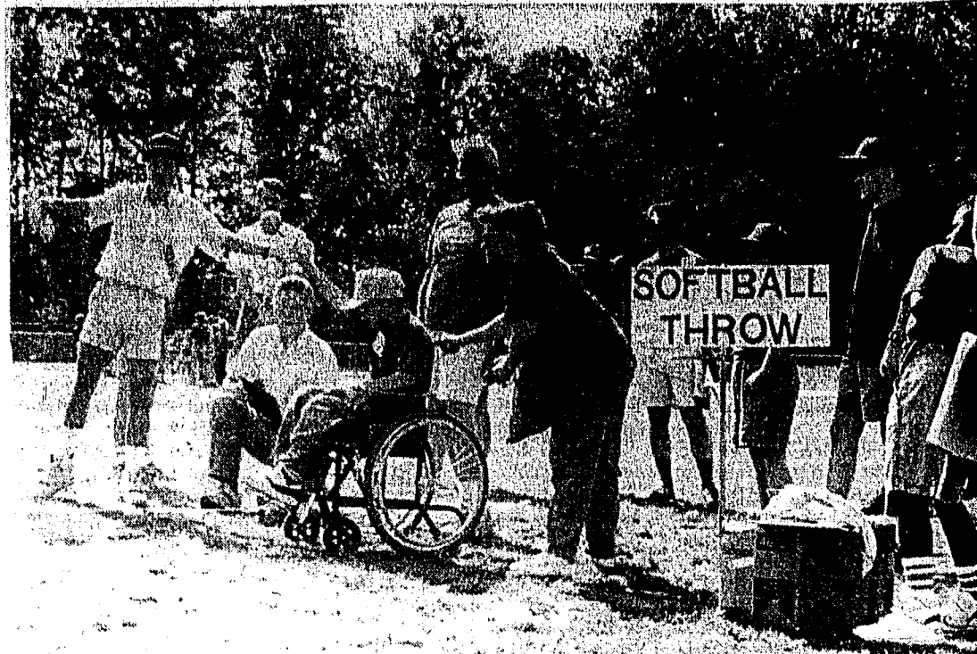
Crowd gathers to watch competitor test his softball throwing skills

Commercial appealed the ruling, which was upheld by the appeals court.