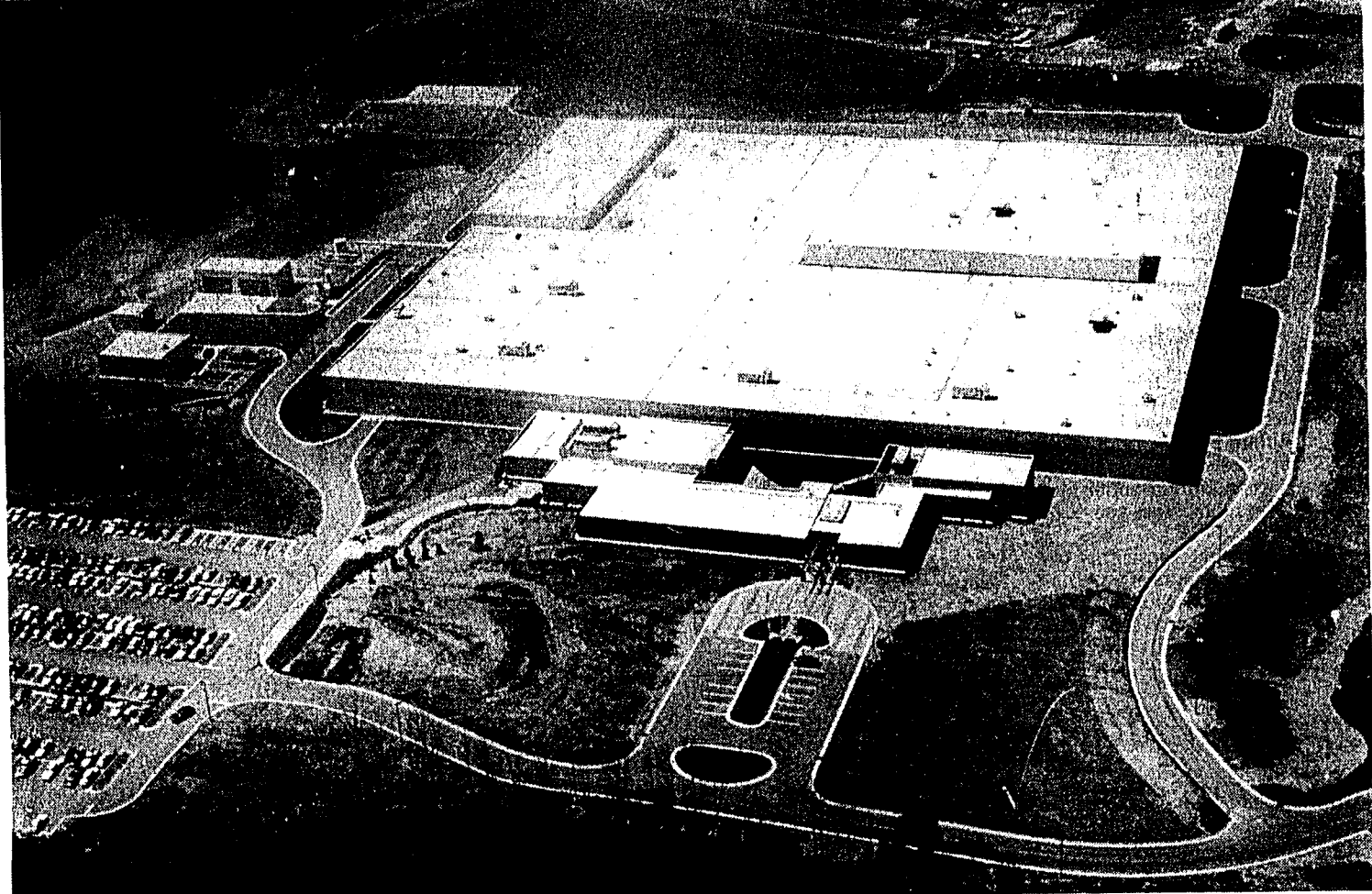
$150 million, 373,000-square-foot plant at business park already producing air compressors

Lakeside serves cable television customers in and around Mooresville, Davidson, Cornelius and Huntersville.