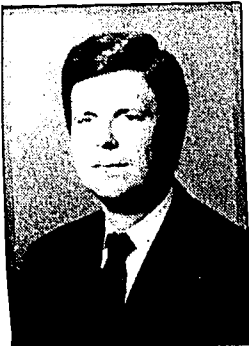
Cavin Funeral Home Since 1925