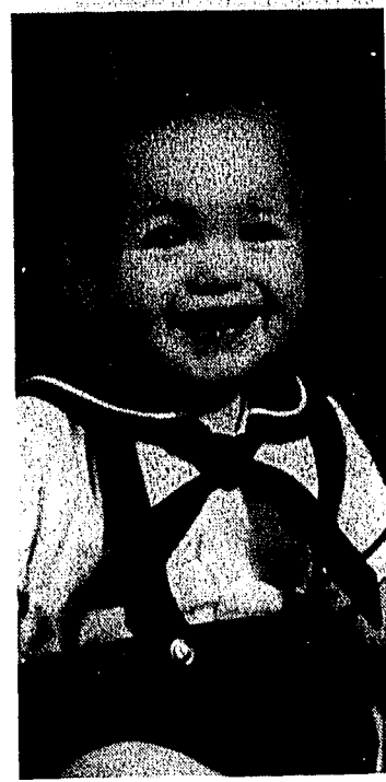
"Dad, My First Party Was Fun ... And Just Think. Your Big Day Is Sunday And I Love You"

Group 2 and Group 3 are asking for more than is available now.