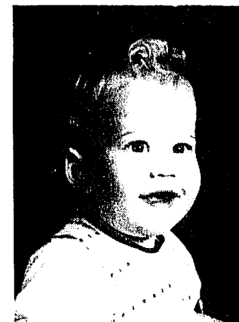
"Hey Dad... Mickey Mouse Is Okay. But You're The Greatest. Have A Good Day"