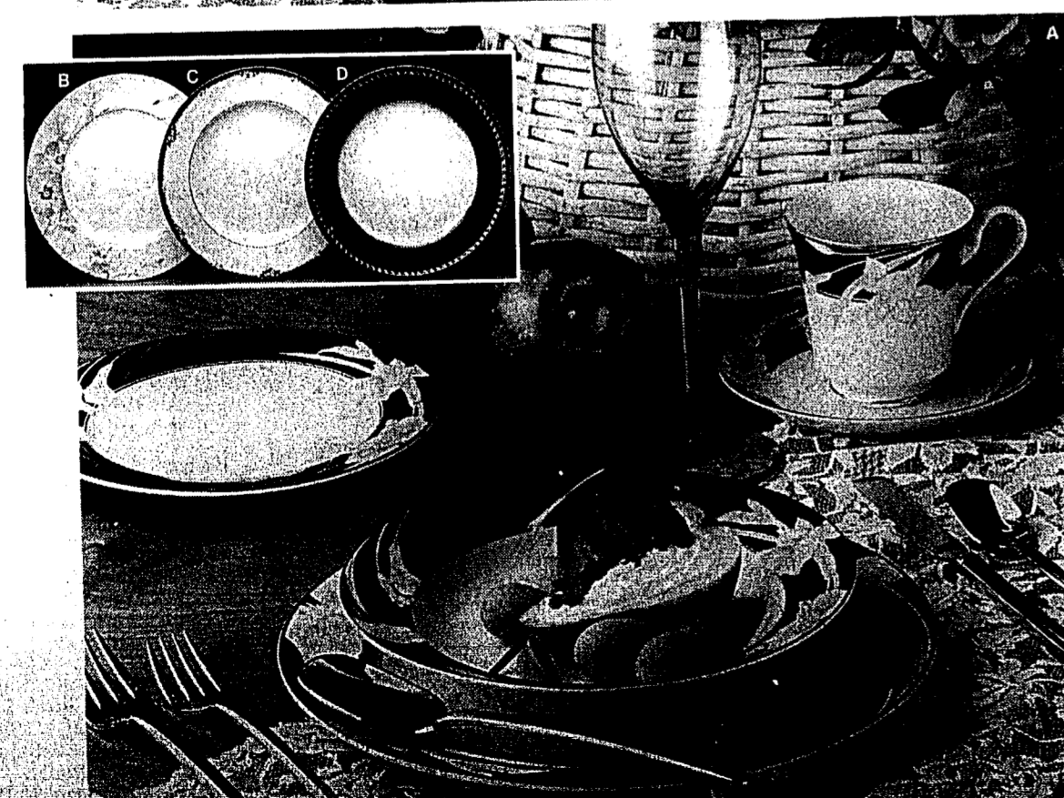
Set dish sets A, B, C, D, E, F, G, H, I, J, K, L, M, N, O, P, Q, R, S, T, U, V, W, X, Y, Z, AA, AB, AC, AD, AE, AF, AG, AH, AI, AJ, AK, AL, AM, AN, AO, AP, AQ, AR, AS, AT, AU, AV, AW, AX, AY, AZ, BA, BB, BC, BD, BE, BF, BG, BH, BI, BJ, BK, BL, BM, BN, BO, BP, BQ, BR, BS, BT, BU, BV, BW, BX, BY, BZ, CA, CB, CC, CD, CE, CF, CG, CH, CI, CJ, CK, CL, CM, CN, CO, CP, CQ, CR, CS, CT, CU, CV, CW, CX, CY, CZ, DA, DB, DC, DD, DE, DF, DG, DH, DI, DJ, DK, DL, DM, DN, DO, DP, DQ, DR, DS, DT, DU, DV, DW, DX, DY, DZ, EA, EB, EC, ED, EE, EF, EG, EH, EI, EJ, EK, EL, EM, EN, EO, EP, EQ, ER, ES, ET, EU, EV, EW, EX, EY, EZ, FA, FB, FC, FD, FE, FF, FG, FH, FI, FJ, FK, FL, FM, FN, FO, FP, FQ, FR, FS, FT, FU, FV, FW, FX, FY, FZ, GA, GB, GC, GD, GE, GF, GG, GH, GI, GJ, GK, GL, GM, GN, GO, GP, GQ, GR, GS, GT, GU, GV, GW, GX, GY, GZ, HA, HB, HC, HD, HE, HF, HG, HH, HI, HJ, HK, HL, HM, HN, HO, HP, HQ, HR, HS, HT, HU, HV, HW, HX, HY, HZ, IA, IB, IC, ID, IE, IF, IG, IH, II, IJ, IK, IL, IM, IN, IO, IP, IQ, IR, IS, IT, IU, IV, IW, IX, IY, IZ, JA, JB, JC, JD, JE, JF, JG, JH, JI, JJ, JK, JL, JM, JN, JO, JP, JQ, JR, JS, JT, JU, JV, JW, JX, JY, JZ, KA, KB, KC, KD, KE, KF, KG, KH, KI, KJ, KK, KL, KM, KN, KO, KP, KQ, KR, KS, KT, KU, KV, KW, KX, KY, KZ, LA, LB, LC, LD, LE, LF, LG, LH, LI, LJ, LK, LL, LM, LN, LO, LP, LQ, LR, LS, LT, LU, LV, LW, LX, LY, LZ, MA, MB, MC, MD, ME, MF, MG, MH, MI, MJ, MK, ML, MM, MN, MO, MP, MQ, MR, MS, MT, MU, MV, MW, MX, MY, MZ, NA, NB, NC, ND, NE, NF, NG, NH, NI, NJ, NK, NL, NM, NN, NO, NP, NQ, NR, NS, NT, NU, NV, NW, NX, NY, NZ, OA, OB, OC, OD, OE, OF, OG, OH, OI, OJ, OK, OL, OM, ON, OO, OP, OQ, OR, OS, OT, OU, OV, OW, OX, OY, OZ, PA, PB, PC, PD, PE, PF, PG, PH, PI, PJ, PK, PL, PM, PN, PO, PP, PQ, PR, PS, PT, PU, PV, PW, PX, PY, PZ, QA, QB, QC, QD, QE, QF, QG, QH, QI, QJ, QK, QL, QM, QN, QO, QP, QQ, QR, QS, QT, QU, QV, QW, QX, QY, QZ, RA, RB, RC, RD, RE, RF, RG, RH, RI, RJ, RK, RL, RM, RN, RO, RP, RQ, RR, RS, RT, RU, RV, RW, RX, RY, RZ, SA, SB, SC, SD, SE, SF, SG, SH, SI, SJ, SK, SL, SM, SN, SO, SP, SQ, SR, SS, ST, SU, SV, SW, SX, SY, SZ, TA, TB, TC, TD, TE, TF, TG, TH, TI, TJ, TK, TL, TM, TN, TO, TP, TQ, TR, TS, TT, TU, TV, TW, TX, TY, TZ, UA, UB, UC, UD, UE, UF, UG, UH, UI, UJ, UK, UL, UM, UN, UO, UP, UQ, UR, US, UT, UY, UZ, VA, VB, VC, VD, VE, VF, VG, VH, VI, VJ, VK, VL, VM, VN, VO, VP, VQ, VR, VS, VT, VU, VV, VW, VX, VY, VZ, WA, WB, WC, WD, WE, WF, WG, WH, WI, WJ, WK, WL, WM, WN, WO, WP, WQ, WR, WS, WT, WU, WV, WW, WX, WY, WZ, XA, XB, XC, XD, XE, XF, XG, XH, XI, XJ, XK, XL, XM, XN, XO, XP, XQ, XR, XS, XT, XU, XV, XW, XX, XY, XZ, YA, YB, YC, YD, YE, YF, YG, YH, YI, YJ, YK, YL, YM, YN, YO, YP, YQ, YR, YS, YT, YU, YV, YW, YX, YY, YZ, ZA, ZB, ZC, ZD, ZE, ZF, ZG, ZH, ZI, ZJ, ZK, ZL, ZM, ZN, ZO, ZP, ZQ, ZR, ZS, ZT, ZU, ZV, ZW, ZX, ZY, ZZ.