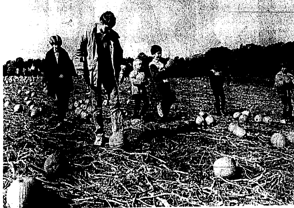
Each Visitor Was Invited To Pick A Personal Pumpkin