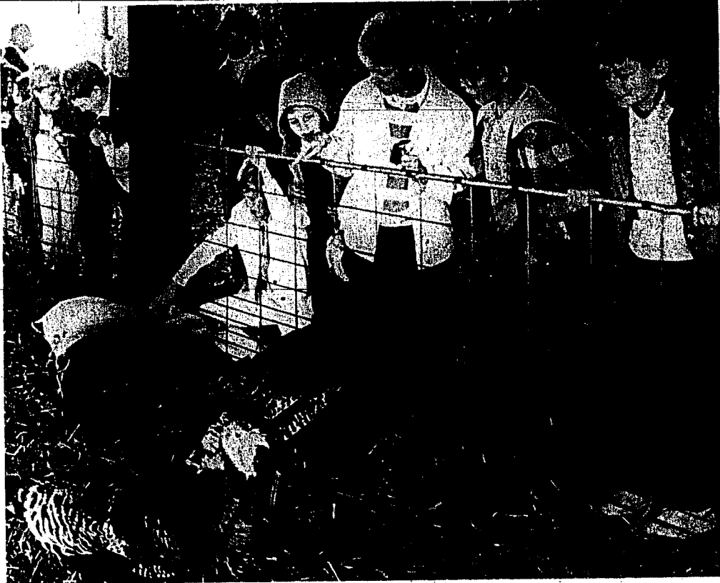
The Petting Zoo Was A Favorite Stop For Everyone