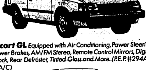
Escort GL Equipped with Air Conditioning, Power Steering, Power Brakes, AM/FM Stereo, Remote Control Mirrors, Digital Clock, Rear Defroster, Tinted Glass and More. (P.E.#294A + A/C)