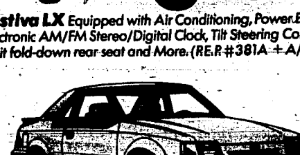
Festiva LX Equipped with Air Conditioning, Power Brakes, AM/FM Stereo, 5-Speed Transmission, Tilt-Turn Point, Styled Steel Wheels, Cloth Bucket Seats, Digital Clock and More. (P.E.#301A + A/C)