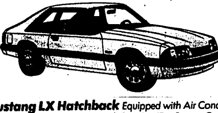
Mustang LX Hatchback Equipped with Air Conditioning, Power Steering, Power Brakes, AM/FM Stereo Cassette, Interval Wipers, Digital Clock, Power Lock Group, Speed Control and More. (P.E.#240A + A/C)