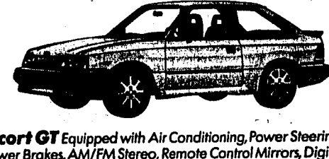
Escort GT Equipped with Air Conditioning, Power Steering, Power Brakes, AM/FM Stereo, Remote Control Mirrors, Digital Clock, 5-Speed Transmission, Overhead Console and More. (P.E.#318A + A/C)