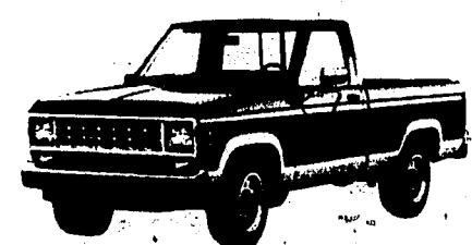
Ranger XLT 4x2 SWB Equipped with Air Conditioning, Power Steering, Power Brakes, AM/FM Stereo Cassette, Tilt-Turn Point, Interval Wipers, Gauge Package, Digital Clock and More. (P.E.#864E / Manual Trans.)