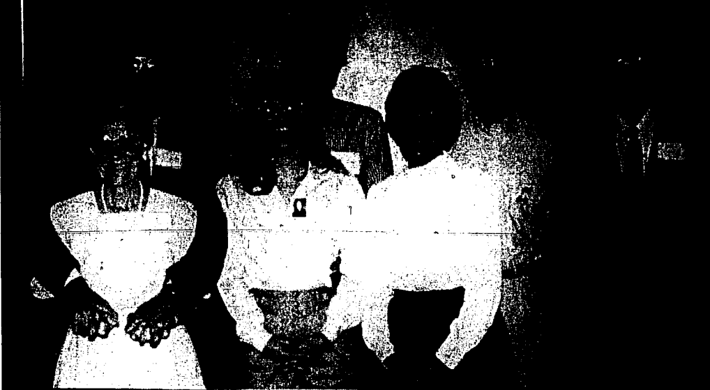
A Nostalgia-Filled Night For Two Generations

High school reunions provide a time to remember and reminisce and a time to catch up on friendships that have faded over the years, but for two Mooreville families reunions held earlier this month were special affairs that produced memories in addition to rekindling them.