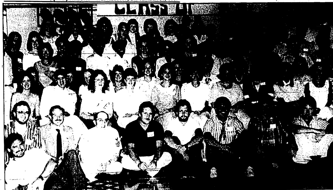
South Iredell High's Class Of '77 Renew Not-So-Old School Ties

See all the happy people. Perhaps they realize that a mere decade of inevitable erosion isn't as damaging as they had thought. They are 1977 graduates of South Iredell High School, and, truth be told, their likenesses are not that far removed from those in their yearbooks. Of the 230-member class, 80 gathered recently for their 10th-anniversary reunion at the Cornelius-Lake Norman Holiday Inn. Everybody recognized