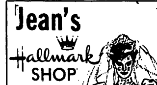
Jean's Bridal Registry

NOW OFFERING a full line of COLD MEATS and CHEESES! * Great Sandwiches * Cold Salads * Imported Cookies & Crackers * Spiced Meat (by the pound) * Party Trays * Fantastic Chili & Other Hot Entrees for a Quick Meal at Home * Cold Beer CALL AHEAD FOR FAST PICK-UP 892-9603 TAKE OUTS ONLY Mon.-Fri. 10 a.m.-7 p.m. Sat. 7 a.m.-3 p.m. FRESH DONUTS EVERY SATURDAY Norman Landing Plaza, Hwy. 73 W.—Cornelius