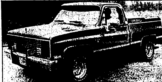
1983 CHEVROLET SILVERADO Fully loaded, cherry red finish, tilt, cruise air, auto, am/fm stereo, slimline matching cab, exceptional one of a kind truck. Don't wait!

on the lot bank financing PLUS EXTENDED WARRANTIES AVAILABLE