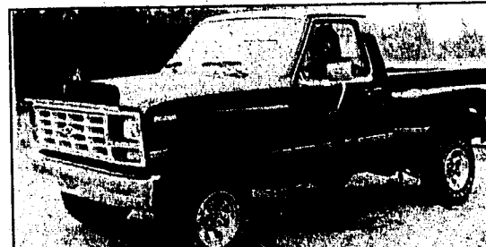
1986 FORD F-150 STEP-SIDE Triple black finish, 4x4, automatic lock-out hubs, sliding rear glass. Get ready for the hazardous weather ahead. This truck is waiting for you.