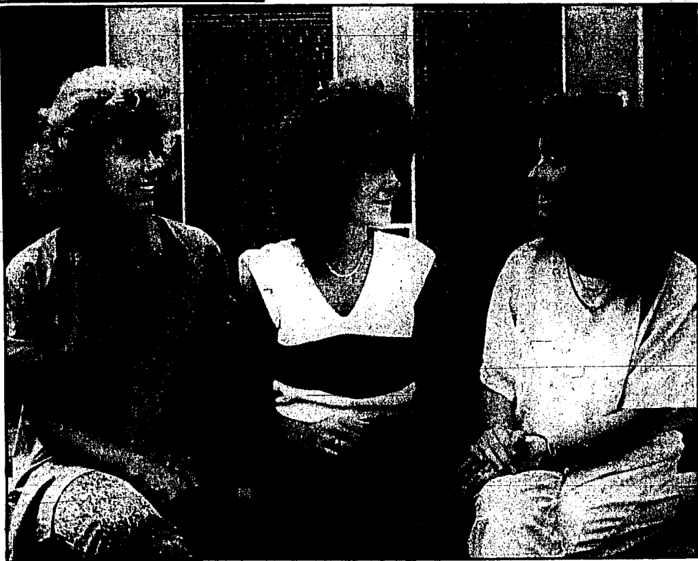
South Iredell High's Student Council Officers

Plus a full array of unusual FREE ACTS — EVERY NIGHT! AND FARMING PIGS FARM EXHIBITS PRIZE CATTLE ARTS & CRAFTS FLOWER SHOW