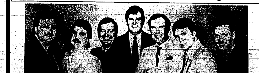
Entertainment By The Down East Boys

A useful, heavy-duty yardstick will be given to every member turning in a filled out Annual Meeting Evaluation questionnaire at the end of the meeting.