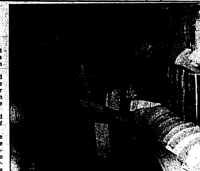
IT'S BULB PLANTING SEASON Templeton, Left, And Culp Make Selections