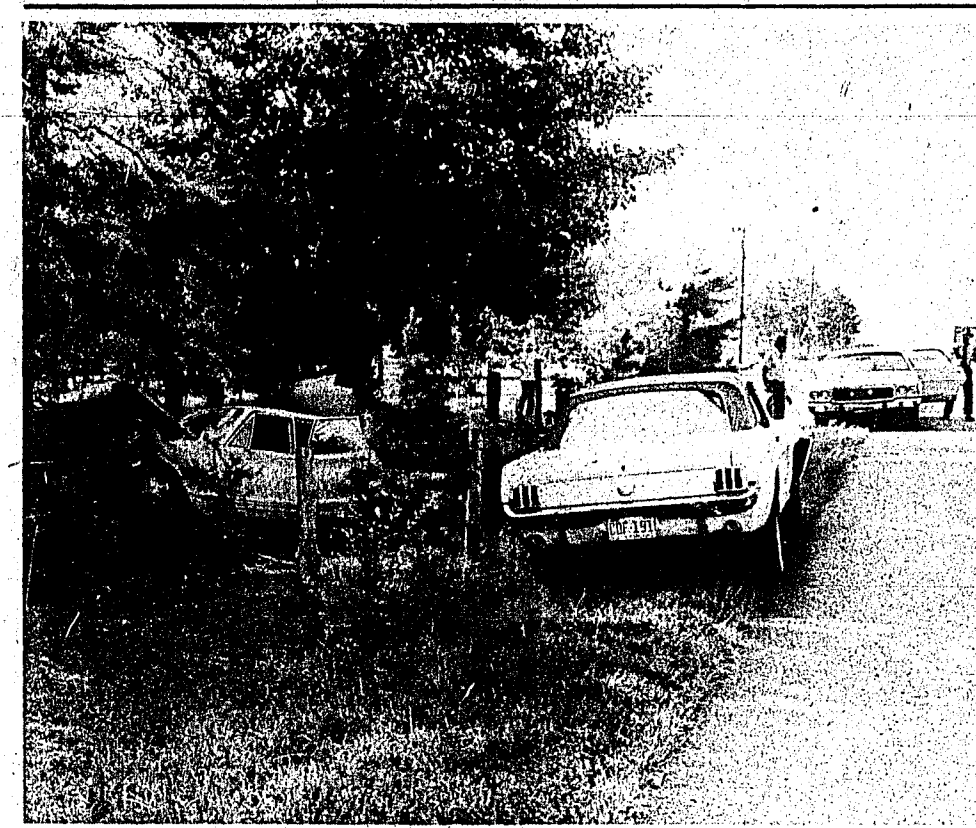
Coddle Creek Road Wreck Scene

VOL. XXXIX Single Copy 15c Mooresville, N. C., (28115) Thursday, September 27, 1973 No. 31