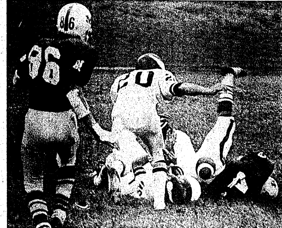
IMP BOBBLE ON HANDOFF WAS RECOVERED BY SOUTH Vikings Took Advantage And Moved For Second-Quarter Score