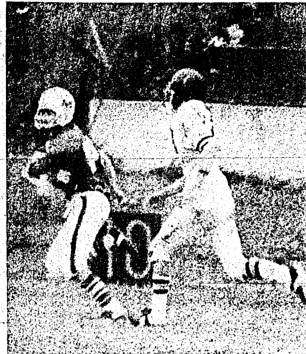
SWING SETS SAIL AFTER TAKING PASS This One Carried 59 Yards To Enemy One