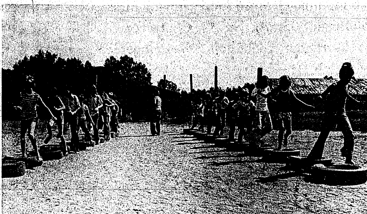
A Race Through Old Tires Is An Agility Exercise