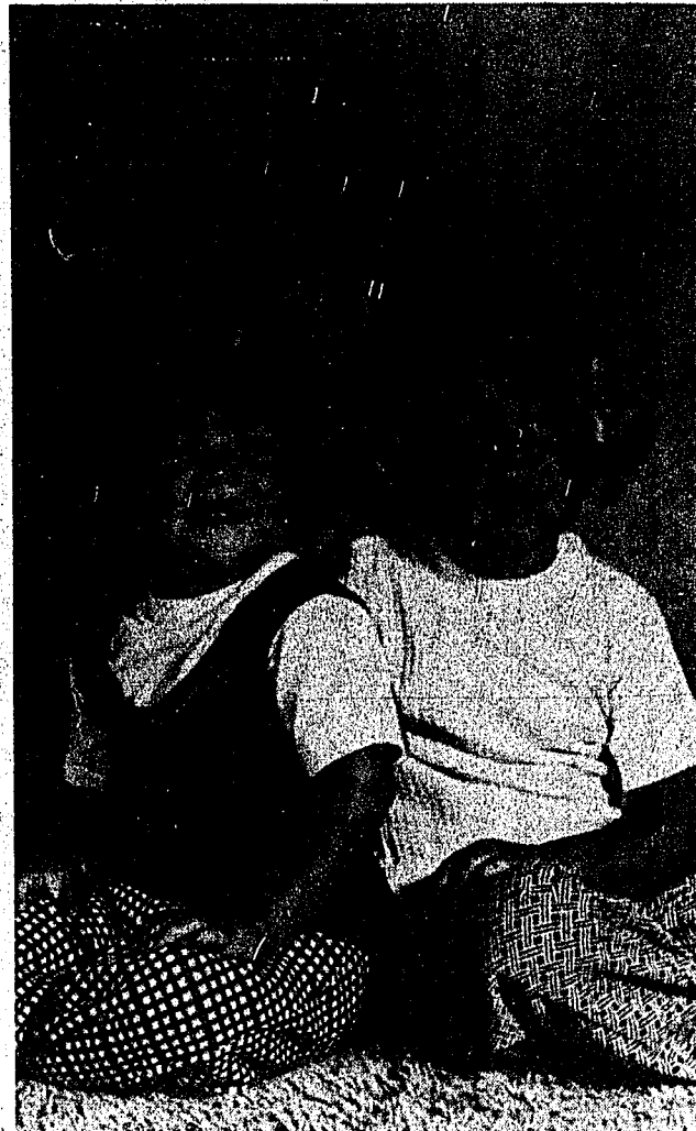
"Handsome Little Fellas"