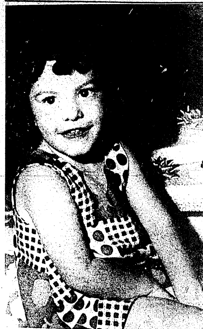
"My Hair Is Naturally Curly"