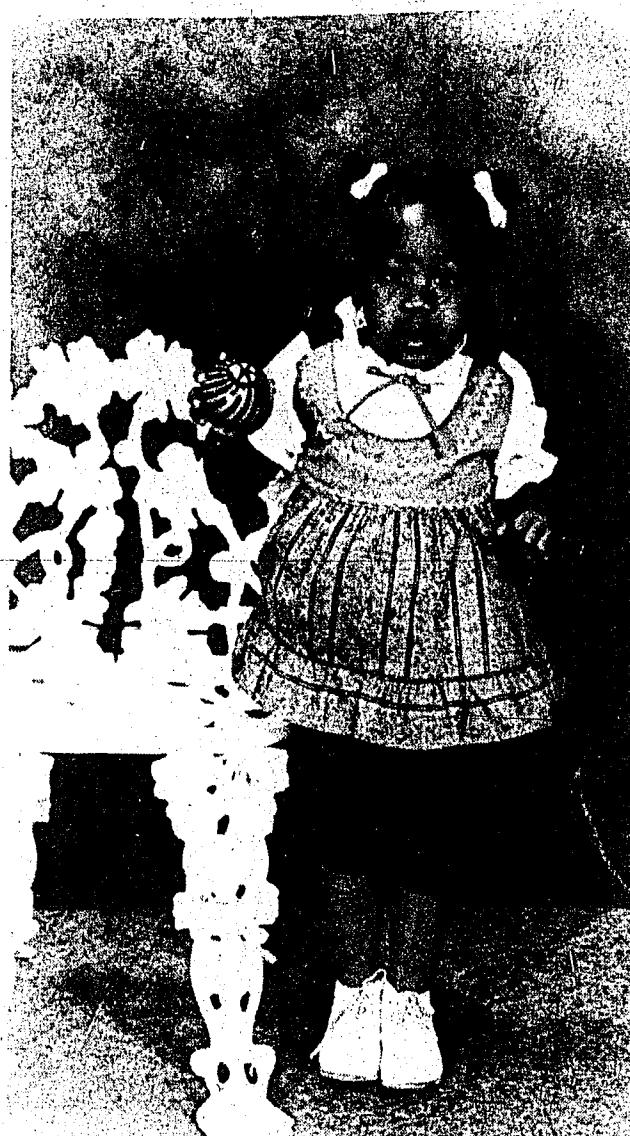
"Aw Come On, Let's Play"