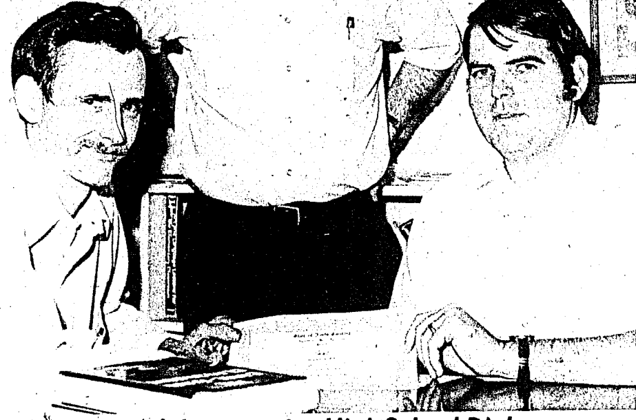
Earns Adult Education High School Diploma