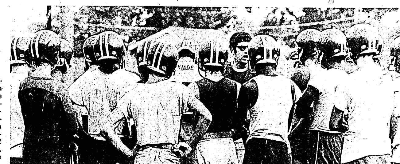
Down To Earth Blue Devil Confab Before Practice Session Gets Underway

PEPPY'S PIZZA BARN 2240 N. Main St. Mooreville, N.C. Fam. & Franch. $1.00 off. Mon.-Sat. 5:00-11:00 P.M. Sun. 11:00-11:00 P.M. 550 N. Main — 664-2792 — Mooreville, N.C.