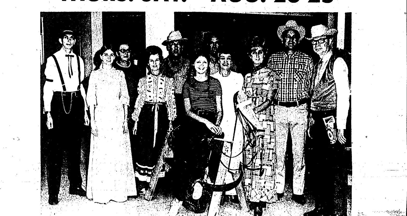
(Frontier Day Scene From 1972)

COME BY AND VISIT WITH THE OLD TIMERS AT MOORESVILLE FEDERAL DURING FRONTIER DAYS!