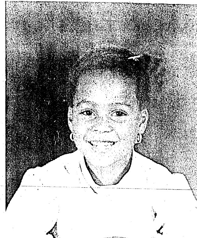
"Grandmothers—I Love Them All"