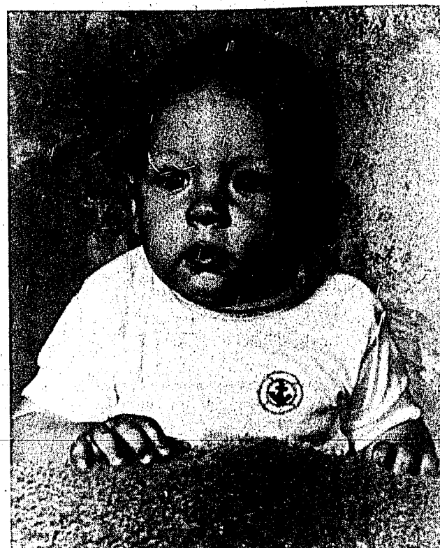
"You Think I'm Spoiled"