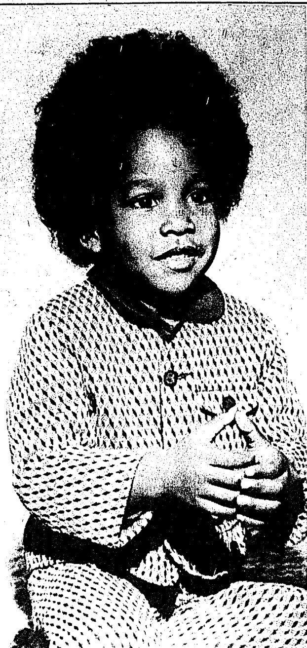
"This Is The Way You Do It"